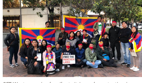
SFT West organized a silent sit-in and prostration in Downtown Berkeley, collecting petition signatures for the Panchen Lama's release.