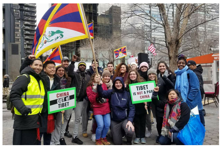
La Salle University students join the Tibetan National Uprising Day rally in New York.

Tibetan National Uprising Day is a pivotal day in Tibetan history that marks the mass rejection and disapproval of the Chinese invasion of Tibet in 1959. This year, the day was observed in over 100 cities in over 30 countries around the world. Tibetans and supporters organized peaceful protests at landmarks and outside Chinese Embassies to show solidarity with the Tibetan Freedom Movement. Worldwide, SFT chapters and members joined in organizing actions and events by providing resources and support in cities including Dharamsala, Bangalore, New York, Toronto, London, San Francisco, Copenhagen, Paris, Taipei, and Japan.