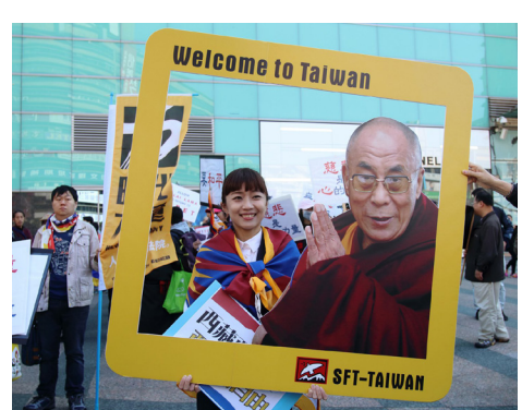
SFT Taiwan members joined March 10, Tibetan National Uprising Day in Taipei city.