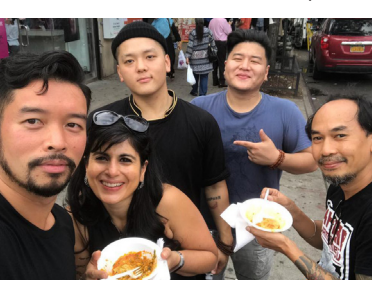
Momo enthusiasts at the Momo Crawl in New York City.

In 2018, SFT hosted more than 2,000 people at Momo Crawls in Toronto, Canada and New York, USA. Both of