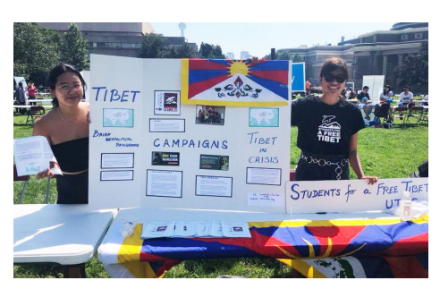
SFT University of Toronto St. George tabling to recruit new members.