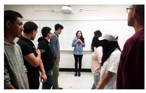
SFT grassroots training at Hunter College in New York.