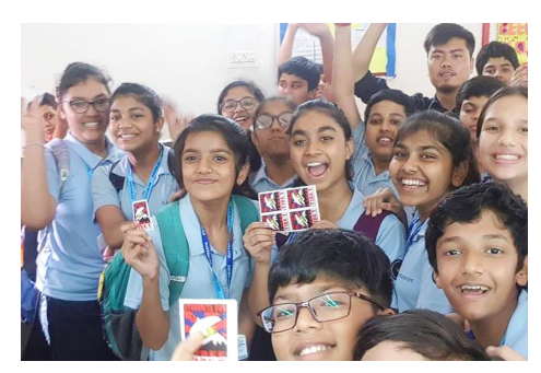
SFT India's 2018 grassroots speaking tour reached 500+ students for Tibet.