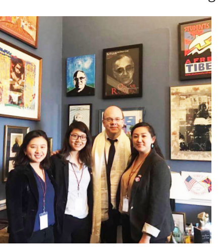
SFT members at US Congressman Jim Mcgovern's office during lobby day.

As a result of years of campaigning and hard work, a major milestone was achieved when the United States House of Representatives approved the Reciprocal Access to Tibet Act on September 24, 2018. This is a historic piece of legislation, originally sponsored by Congressman Jim McGovern. Under this bill, Chinese authorities who are involved in the design and implementation of policies that restrict travel to Tibetan areas would become ineligible to receive a visa or be