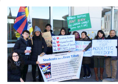
Tibetans and supporters protesting UMass Boston's potential renewal of their Confucius Institute contract.

There is growing momentum for "Say 'No' to CI" around the world, with students, faculty, and community members engaging in the campaign and the issue being raised at the highest government levels. In the United States, the John McCain 2019 National Defense Authorization Act was signed